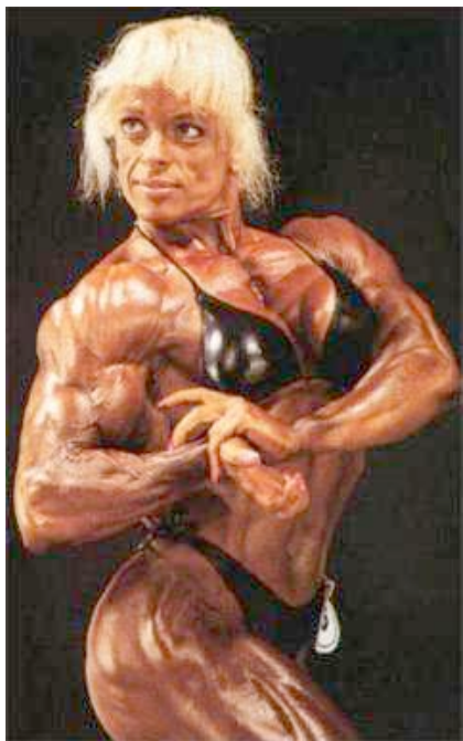
Fit or Grotesque?

The benefits of Olympic weightlifting don't end with strength, speed, power, and flexibility. The clean and jerk and the snatch both develop coordination, agility, accuracy, and balance and to no small degree. Both of these lifts are as nuanced and challenging as any movement in all of sport. Moderate competency in the Olympic lifts confers added prowess to any sport.